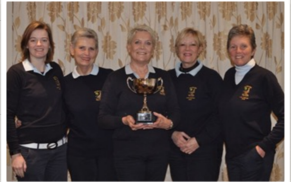
Ladies Scratch Team Win Div 3 League & promoted to Div 2